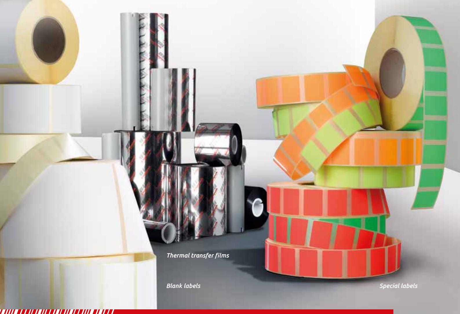
Thermal transfer films